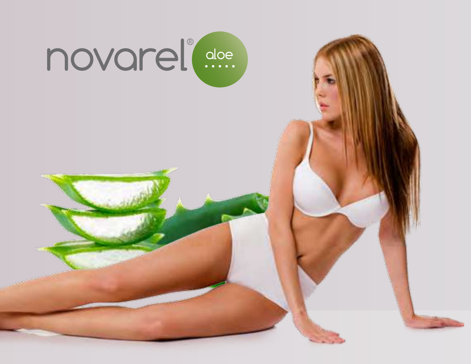
Helps moisturize the skin