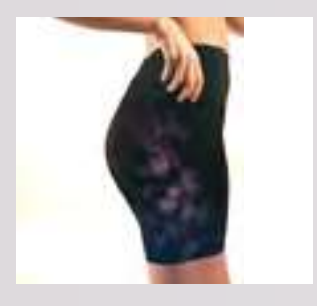
Microcapsules content is released during the garment use.